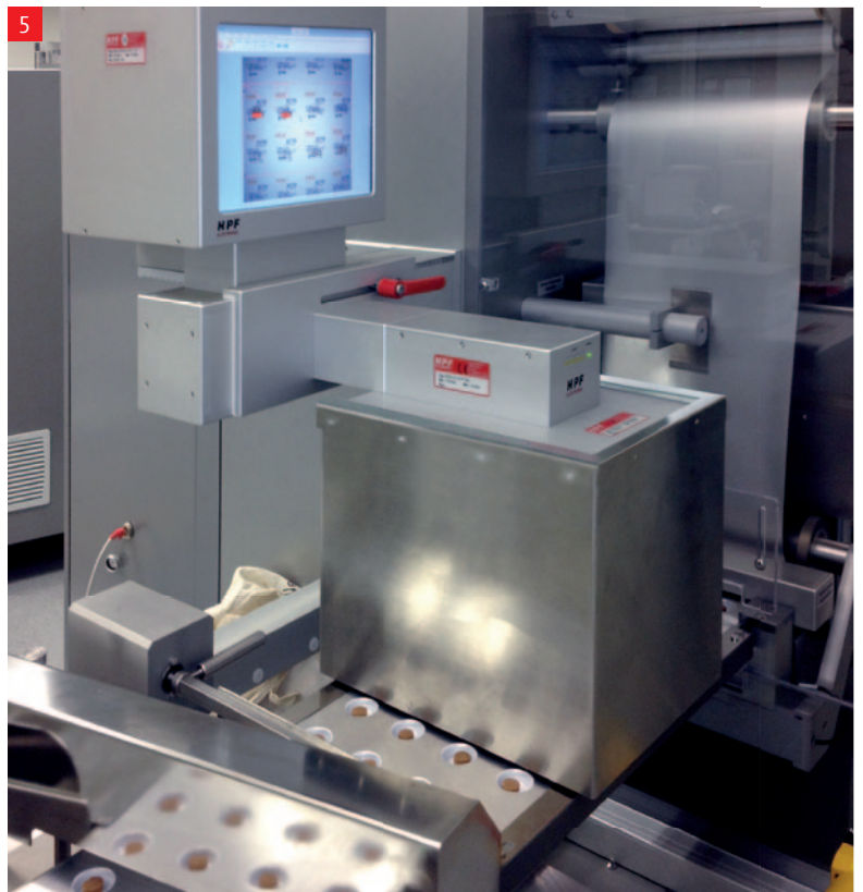
Pic. 4 and 5) Mountigs